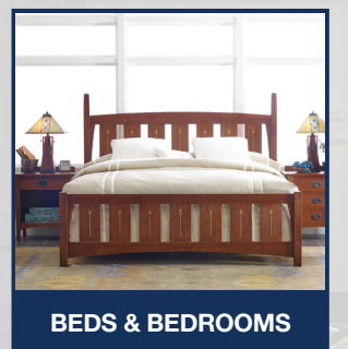
BEDS & BEDROOMS