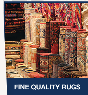
FINE QUALITY RUGS