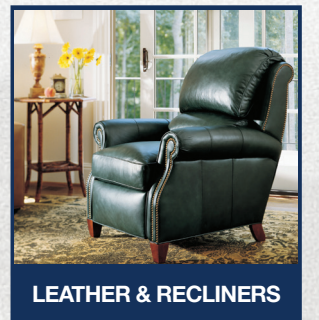
LEATHER & RECLINERS

For more information or directions call 509-350-2114 or visit: EnnisRetirementSale.com